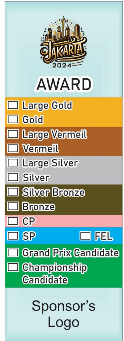
Figure 3 Ribbon Medal